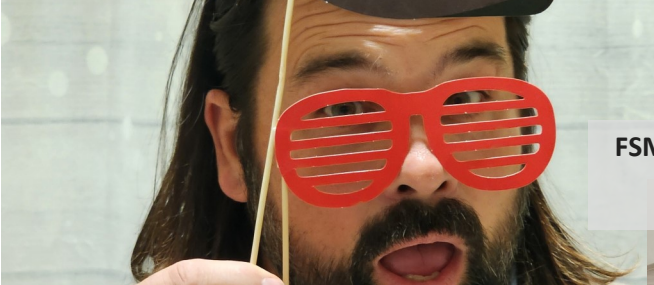
FSM Christmas Party