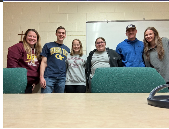
YOUNG ADULT GROUP