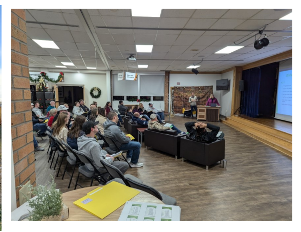
UPWARD COACH MEETING