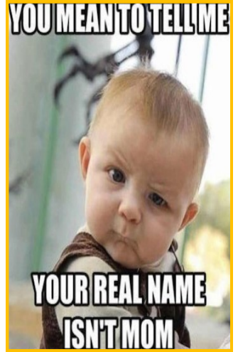
Mother's Day is May 14.